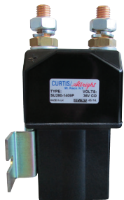
102-SU280-1409P 36V Solenoid