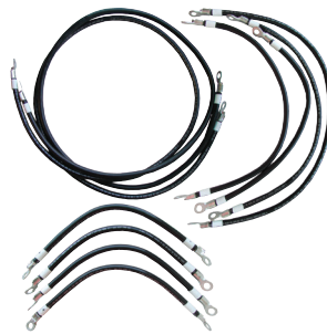
62-EZ-4G For E-Z-GO PDS & TXT