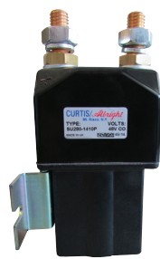
102-SU280-1410P 48V Solenoid