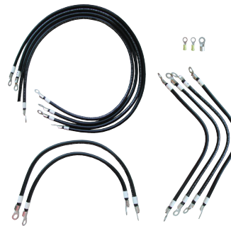
62-CC6X8-4G For Club Cars with (6) 8V Batteries