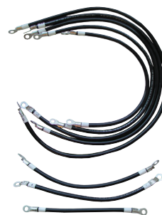
62-YAM-4G For Yamaha Drive