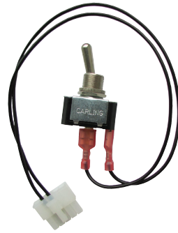
76-1268-TURFEKP For 1268 PDS Conversion Kit